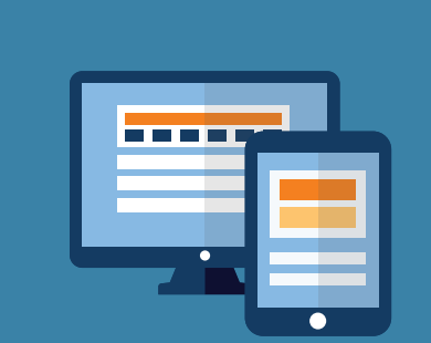
Poor integration between channels