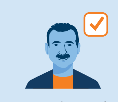
Proactive and personalized service