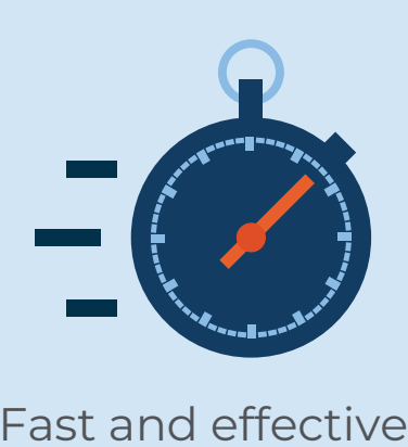
Fast and effective resolution