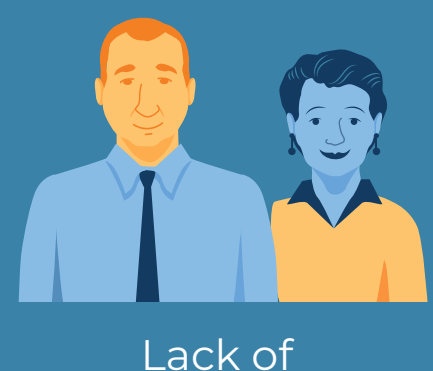
Lack of empowerment at the frontline