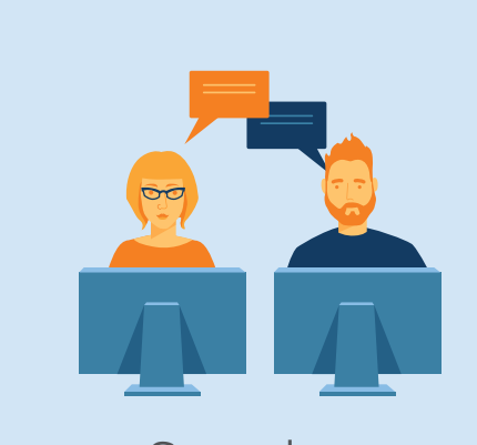
Seamless communication between departments